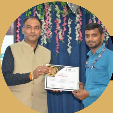
Best Registrar Award