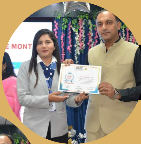
Employee of the Month (JMC)

www.iimtindia.net @iimtIndia @iimtNoida @iimtMeerutGreaterNoida @iimtGroupofColleges