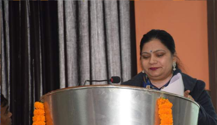
Eminent Guest & Research Professionals addressing Conference