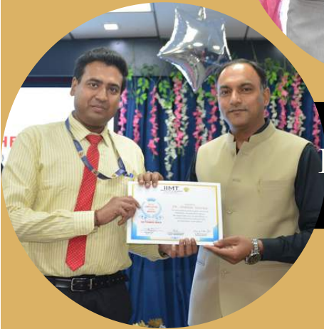
Employee of the Month (BBA)