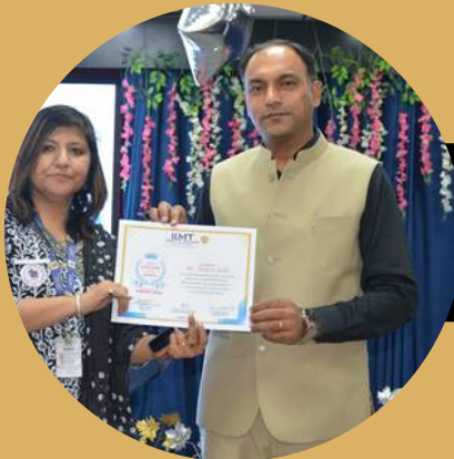
Employee of the Month (Trainer)