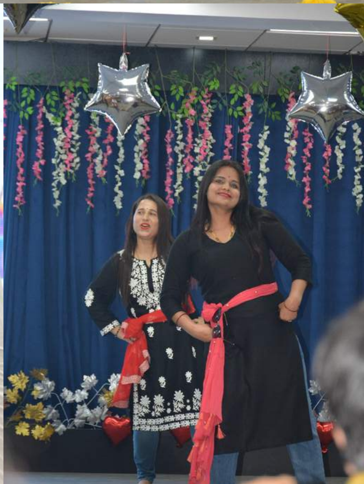
FACULTY CELEBRATING HOLI